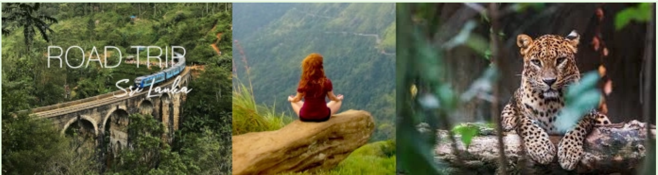
Sri Lanka vacations - Guided nature tours and expeditions

Timing: The experiment was launched during the COVID-19 pandemic, when Sri Lanka's tourism-dependent economy was already severely impacted.