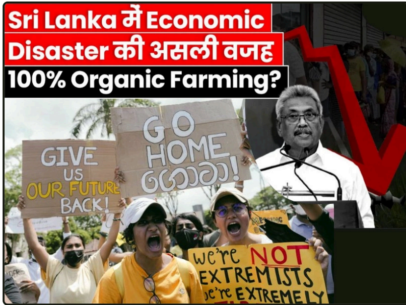
Sri Lanka economic disaster