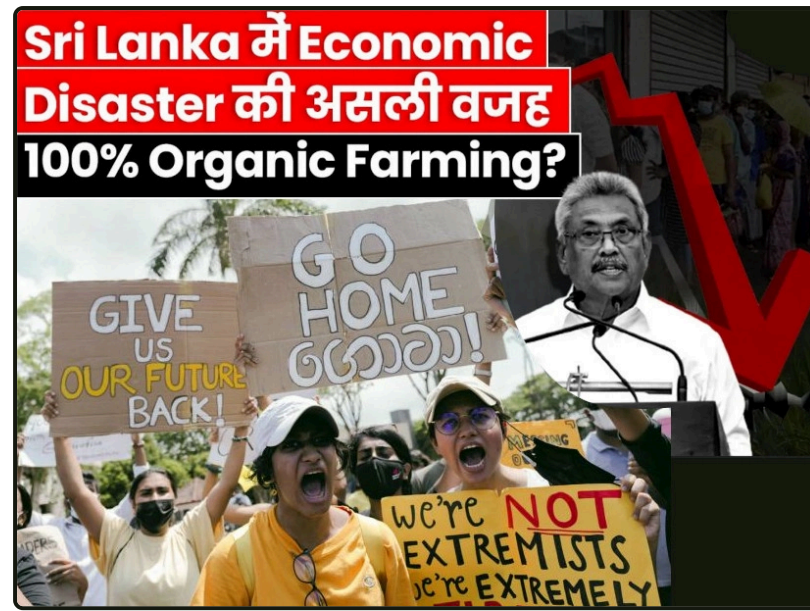
Sri Lanka economic disaster