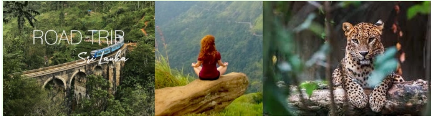
Sri Lanka vacations - Guided nature tours and expeditions

Timing: The experiment was launched during the COVID-19 pandemic, when Sri Lanka's tourism-dependent economy was already severely impacted.